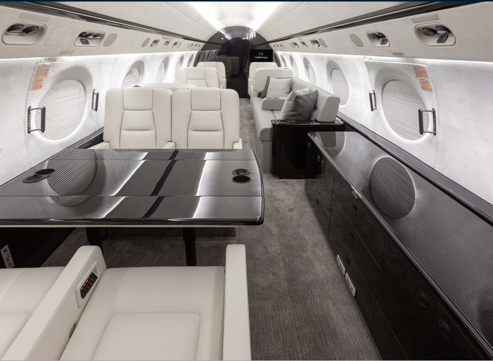
Third cabin looking forward