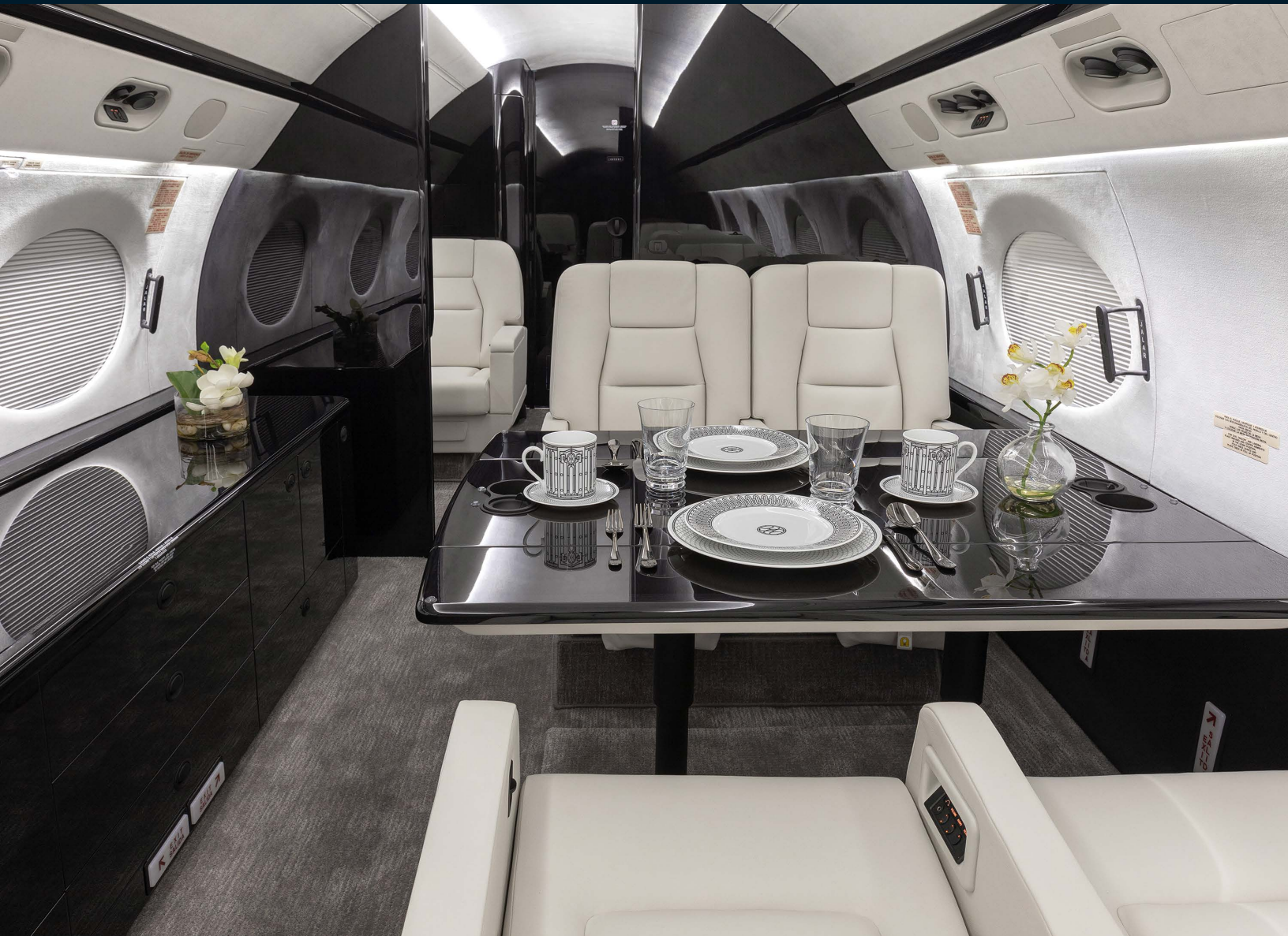
Third cabin looking aft