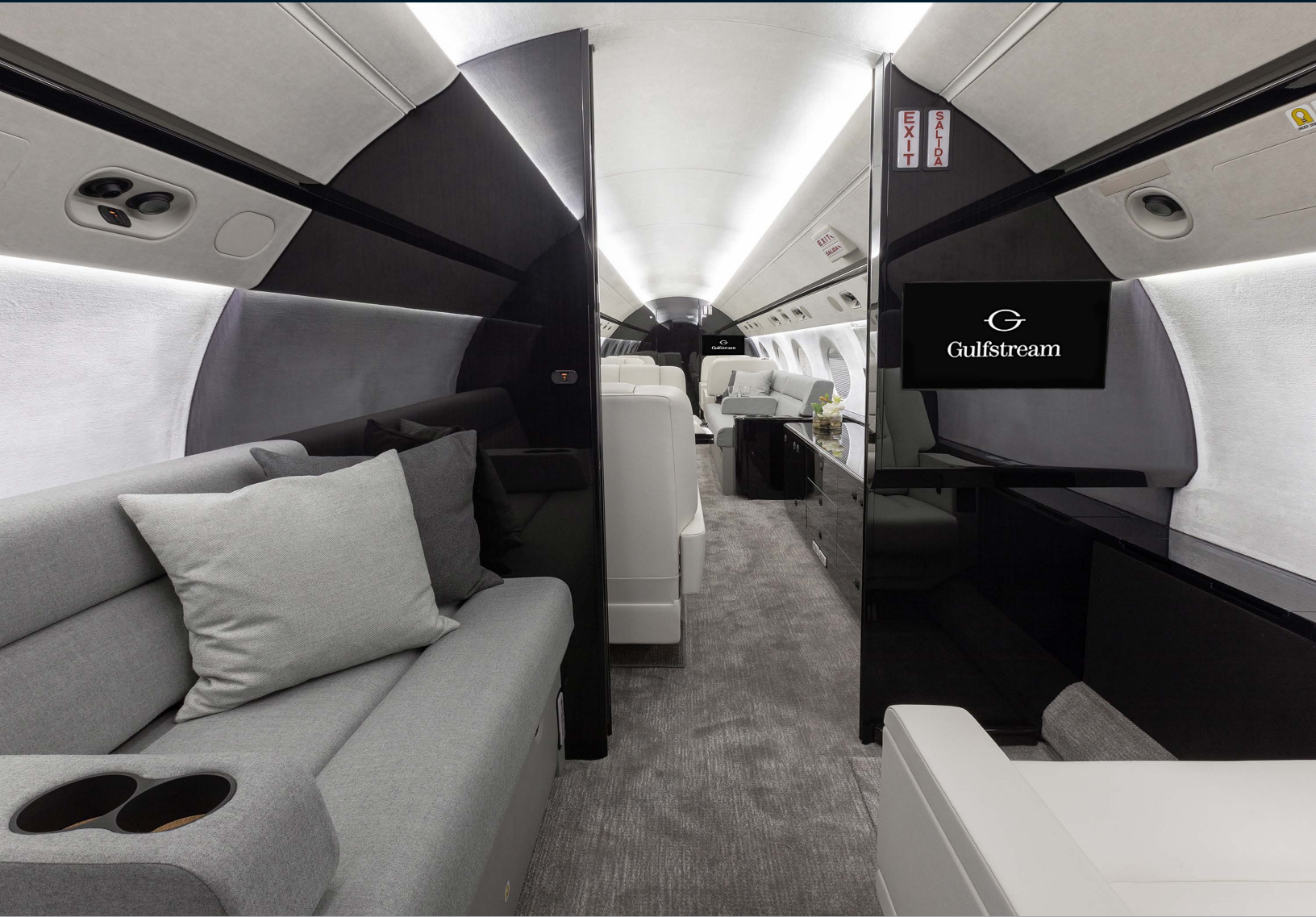
Fourth cabin looking forward