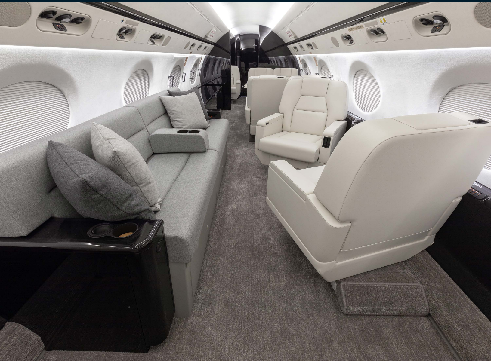
Second cabin looking aft