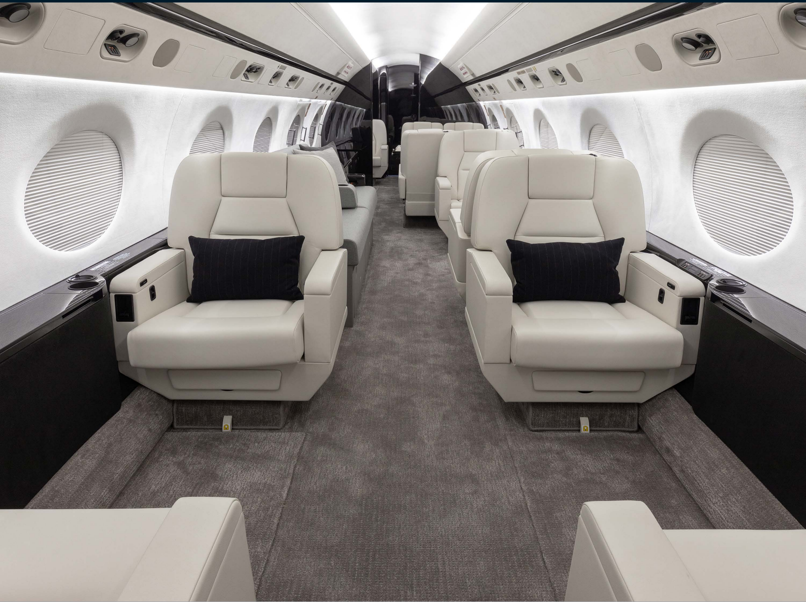
First cabin looking aft