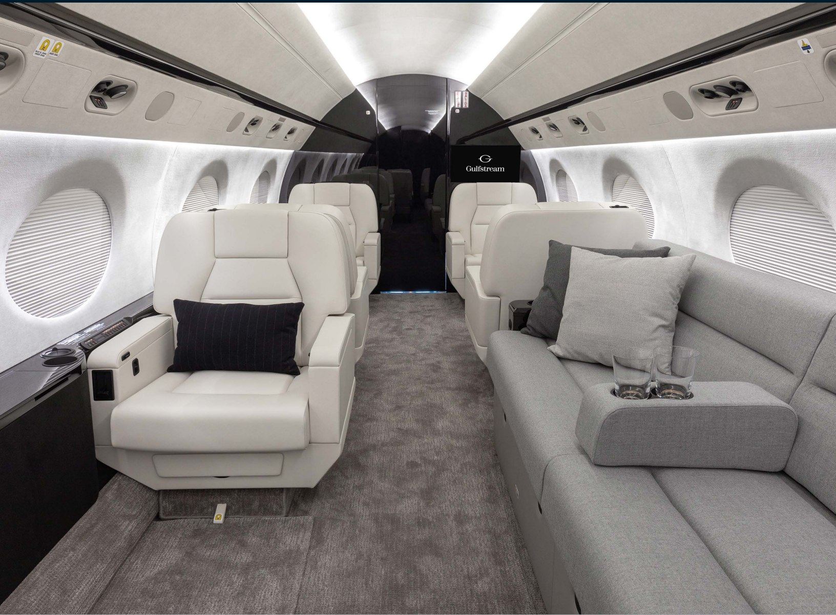
Second cabin looking forward