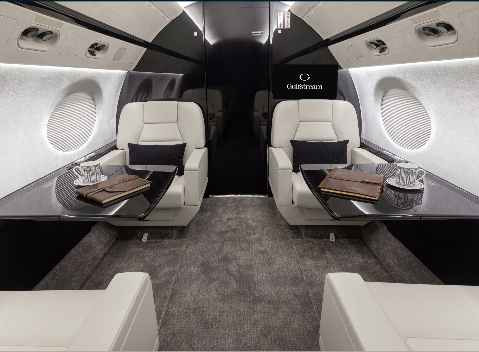
First cabin looking forward